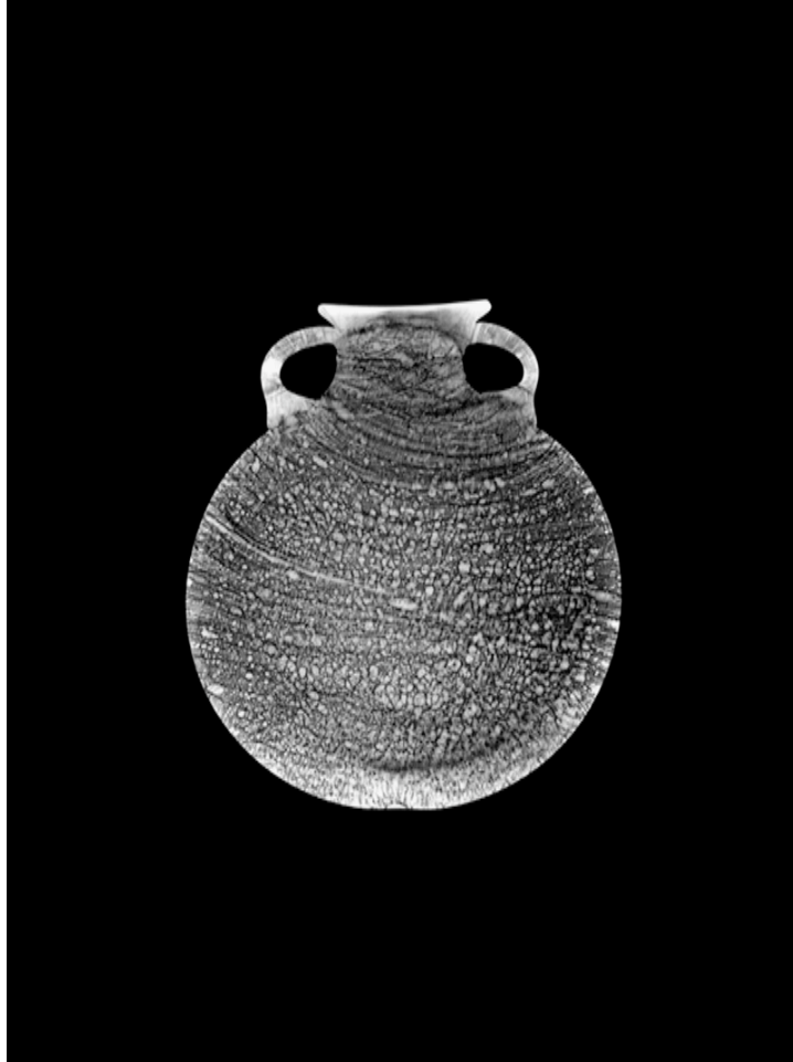
ABOVE: EMPTY BOTTLE NO.1 1998 GELATIN SILVER PHOTOGRAM, 20" X 16"